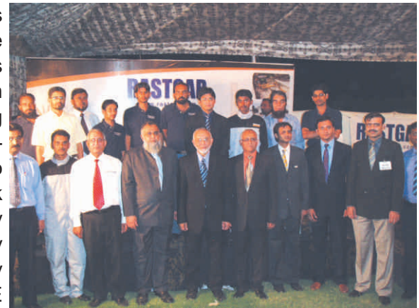
Rastgar team at CASE Backhoe Launch Ceremony

Pakistan provides endless opportunities for enterprising businessmen in the housing and construction sectors. It is possible for small business people with will and zeal to create a business catering to construction industry demand for on-time delivery of projects related to trenching, pipe-laying, side-walk construction, foundations and masonry work of small and large building sites by using modern, affordable machinery Rastgar & Co have teamed up with CASE Construction to bring to the market and service high productivity construction machines like BACKHOE, SKID STEER and TELEHANDLER. The CASE Backhoe is the “Swiss army knife” of the construction industry. The Multi purpose all-in-one machine has proved its success all over the world, providing a productivity construction tool to small and big contractors who use it in municipal work, golf courses, cement plants, mines, quarries and housing projects.