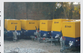
CompAir at Quarry site in Risalpur, FATA

Pakistan is the 6th largest mineral extractor of marble and granite and has a place on world mining map. Pakistan contains major deposits of export quality marble, granite and onyx in wide range of colors, shades and patterns. All provinces in Pakistan have ornamental stone deposits.